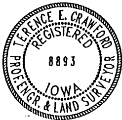
Terence E. Crawford